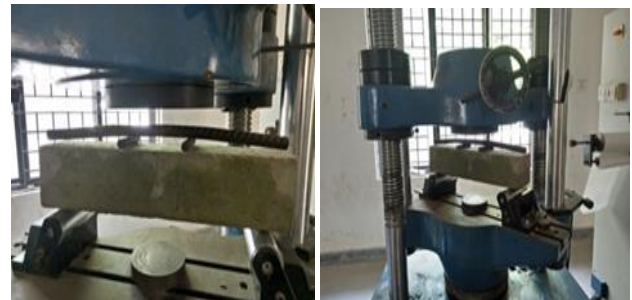
Figure 8 : Universal testing machine

Flexural strength test was carried out as per IS 516: 1959 in PCC beam specimen. The specimens are tested after 28 days of water curing and two specimens were tested for each mix Table 4.4 shows the flexural strength at different replacements of waste marble powder and Fig.4.3 shows the graphical representation of flexural strength.