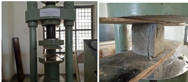
Figure 6 : Compression testing machine

Compression strength test is the important and most common test conducted. Compressive strength of concrete is a measure of its ability to resist static load. As per IS: 516-1959, the compression test can be carried out on specimens cubical or cylindrical in shape. Table 4.2 shows the compressive strength of self compacting concrete containing varying percentage of waste marble powder and Fig.4.1 shows the graphical representation of compressive strength.