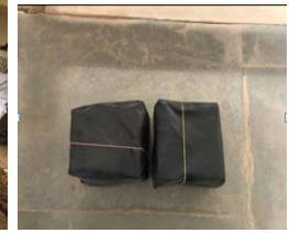
Figure 3 : Polythene curing