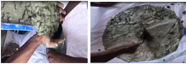
Figure 5 : Slump cone test