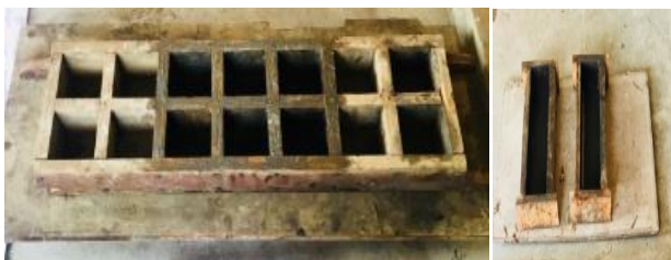
Figure 1 : Images of Moulds

Based on the Indian Standard (IS: 10262 – 1982), design mix for M30 grade of concrete was prepared by partially replacing fine aggregate with five different percentages by weight of marble powder (0%, 10%, 20%, 30%, 40%). The concrete cubes of size 100x100x100 mm and beams of size 100x100x500 mm were casted. The six specimens of cube and two specimens of beam of each mix were prepared. After 48 hrs the specimens were removed from the mould subjected to water curing for 7 & 28 days and polythene curing for 28 days. After curing the specimens were tested for compressive strength and flexural strength.