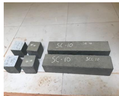
Figure 4 : Images of specimens