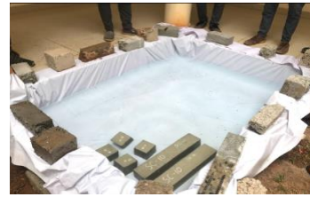
Figure 2 : Water curing